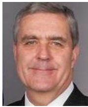
Lieutenant General Douglas Lute Former Permanent Representative of the United States to NATO (tentative confirmation)