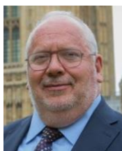
The Lord Harris of Haringey House of Lords, United Kingdom