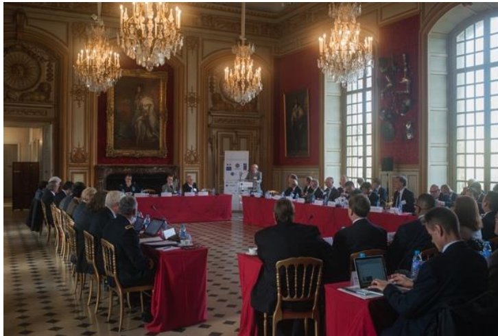
King's Council Chamber of the Hôtel National des Invalides