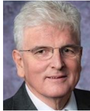
The Rt Hon. the Lord Browne of Ladyton House of Lords, United Kingdom; Former Secretary of State for Defence