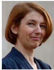
Her Excellency Florence Parly Minister of the Armed Forces of France