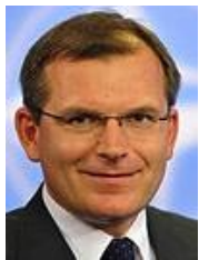
Ambassador Jiří Šedivý Permanent Representative of the Czech Republic to NATO; Former Minister of Defense of the Czech Republic (confirmed)