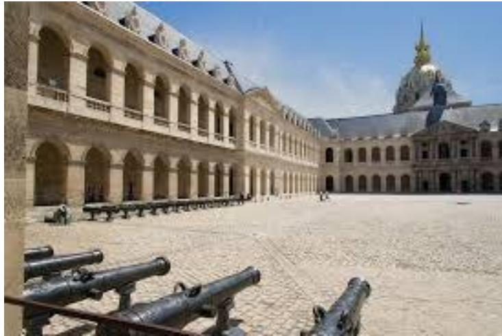
“Cour d’Honneur” of the Invalides