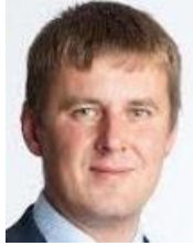
His Excellency Tomáš Petříček Minister of Foreign Affairs of the Czech Republic